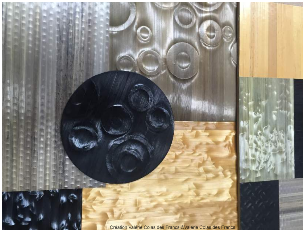
Création Valérie Colas des Francs ©Valérie Colas des Francs