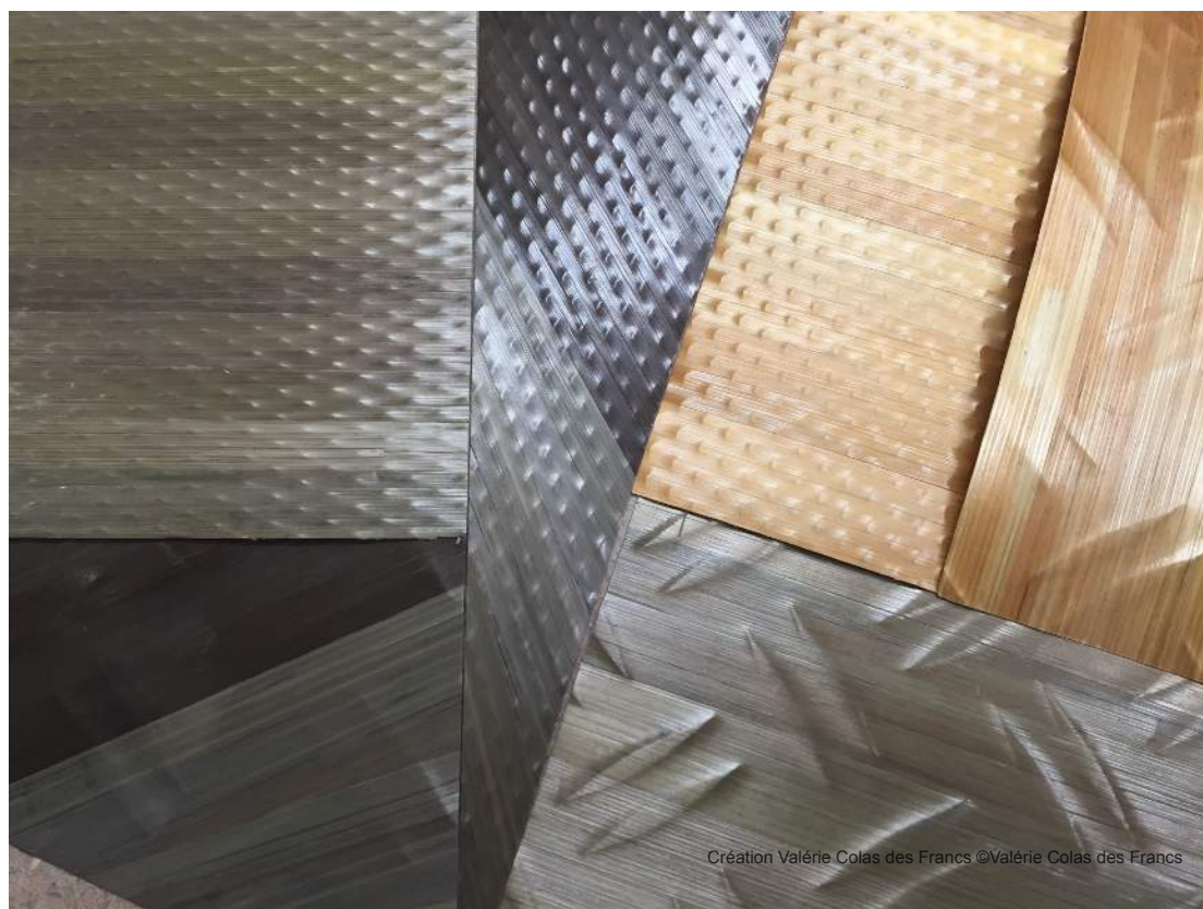
Création Valérie Colas des Francs ©Valérie Colas des Francs